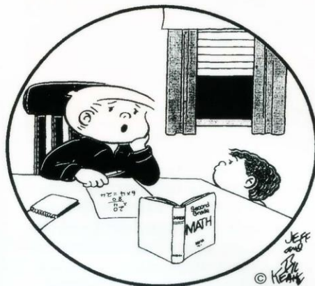
"The Bible tells us to study math. It says, 'Go forth and multiply.'"